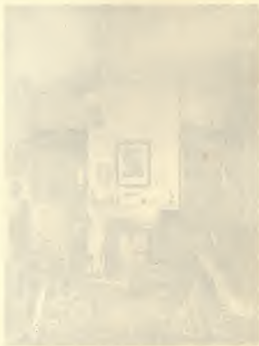
Mr. Whittier's Study, Oak Knoll, Danvers